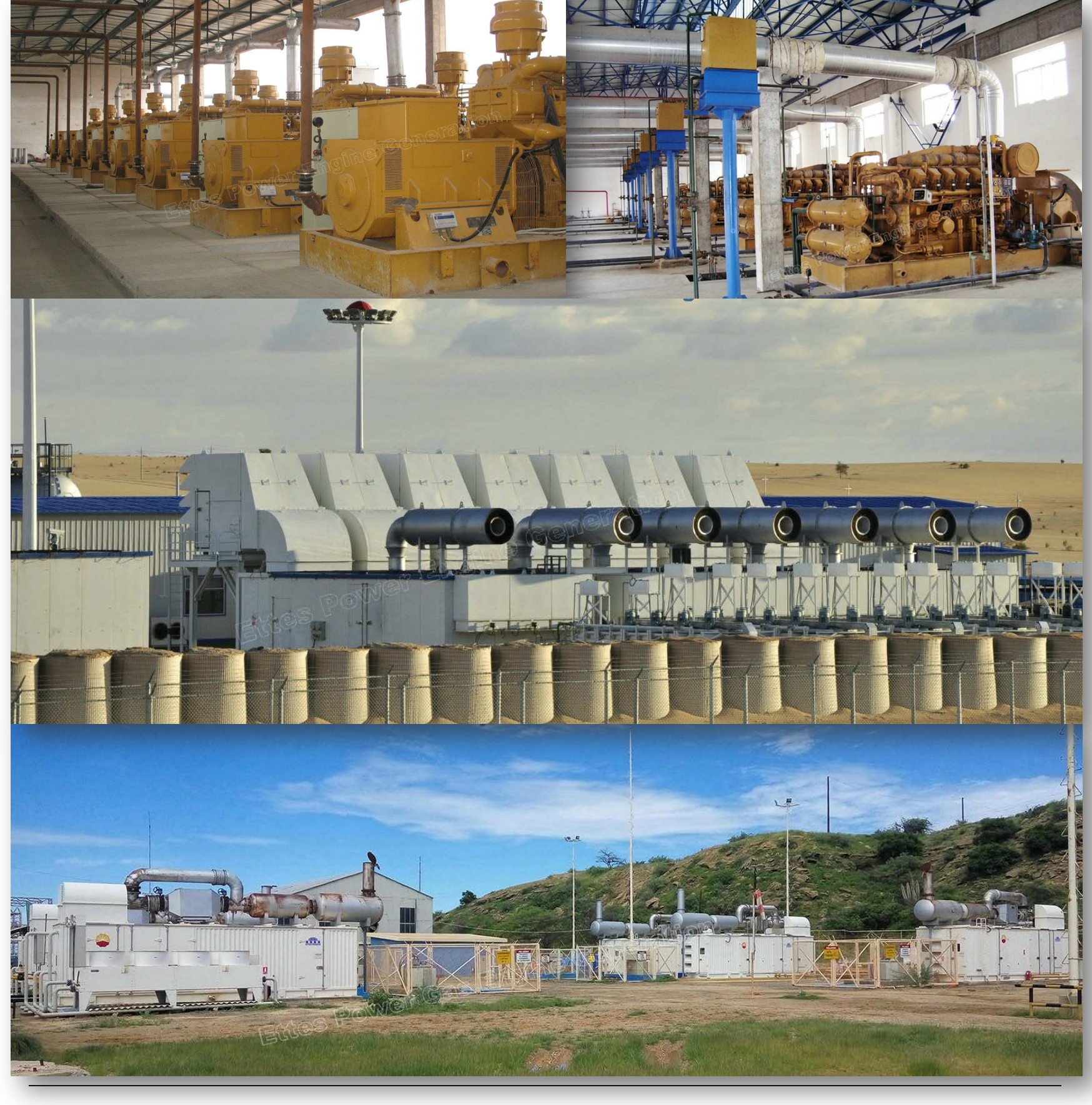
Knowing it is Ettes Power-The Key Supplier for Complete Power Generating System-

\bigstar \text{Above values are provided for information purpose only and are non-binding. The data given in official offer is decisive.}